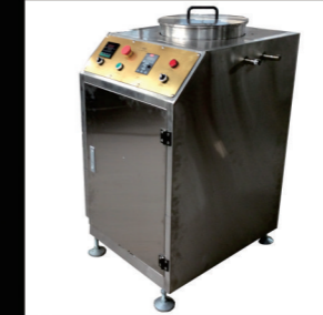
真空熬糖机 Vacuum cooker