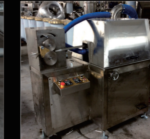
充气熬糖机 Air inflation cooker